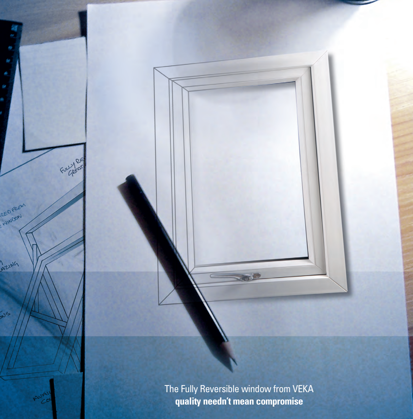
The Fully Reversible window from VEKA quality needn't mean compromise